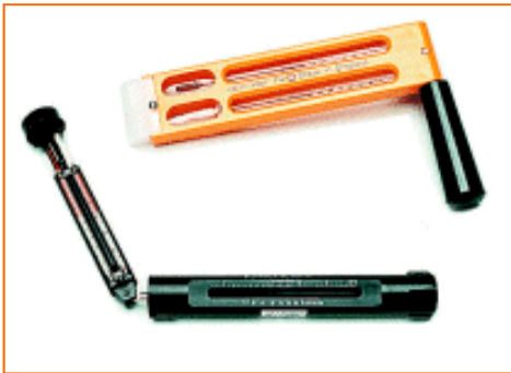
Elcometer 116 Whirling & Sling Hygrometer