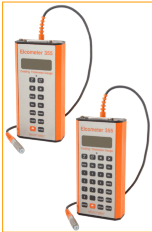
Elcometer 355 Coating Thickness Gauge

The Elcometer 355's watchwords are accuracy, simplicity, versatility and durability making this a true state of the art hand held measuring system packed with time-saving and cost-cutting features.