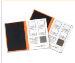
Coated Thickness Standards

The new version of the Elcometer 456 now benefits from a larger display for easy data viewing and a simple calibration feature to make testing even quicker. The Elcometer 456 also features Bluetooth® wireless technology for fast data transfer to ElcoMaster™ Software, ideal for easy report generation and archiving of readings.